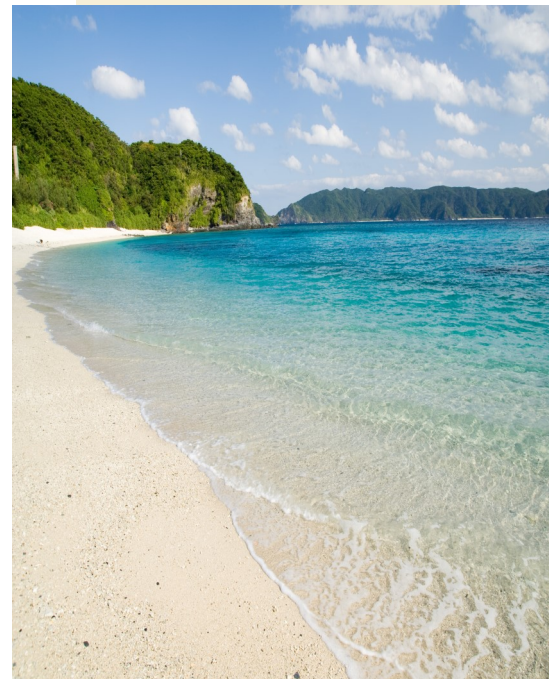
For those enjoying the sun and beaches in Florida or elsewhere warm!!